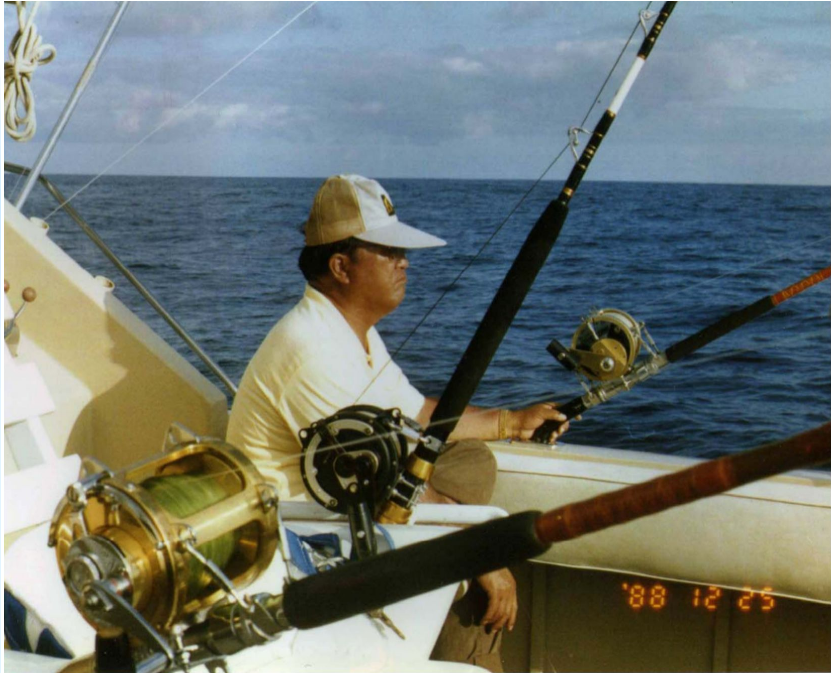
Challenging the Blue Marlin fishing on a charter boat (fishing pioneer, off the coast of Kona, Hawaii)