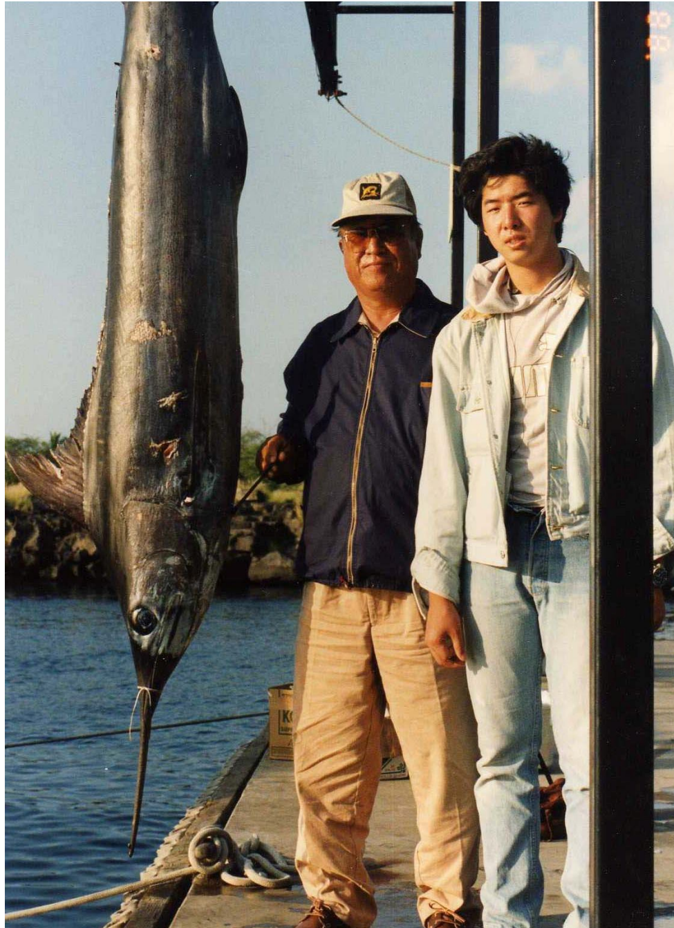
With the Blue Marlin they caught (Kona Marina)