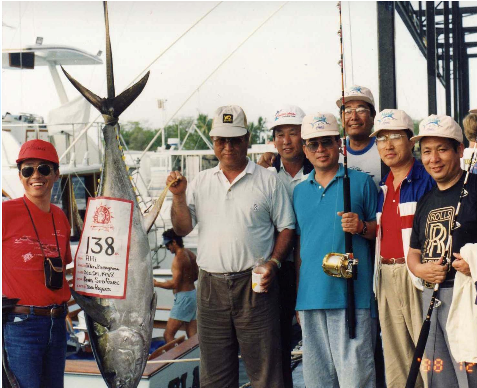
With Yellowfin Tuna (Kona Marina)