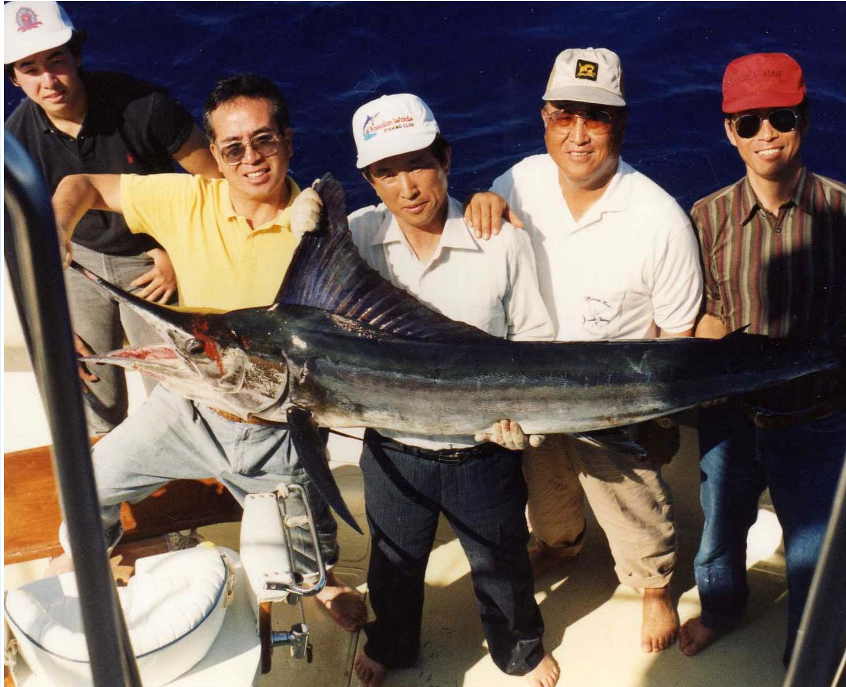
With Blue Marlin (on a charter boat)