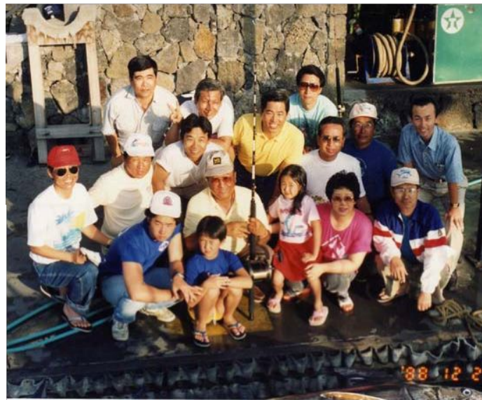
Together with True Children and Ocean Providence leaders At Kona Marina, Hawaii, December 1988

It is said that more than 50% of Hawaiian population is comprised of Japanese and Korean origins, making it a land of eastern and western fusion. It is a place to become the center of Pacific Rim Providence starting in the year 2000. Target fish are diverse from Blue Marlin to Mahi Mahi.