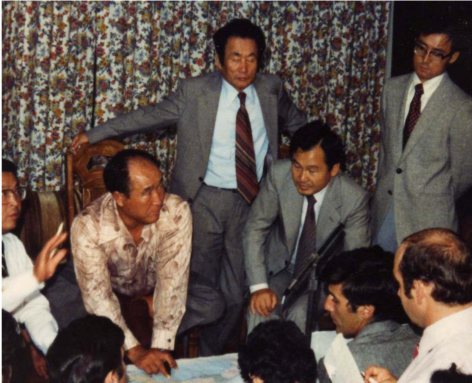
Historical moment of the establishment of Ocean Church on October 1, 1980 (Morning Garden, Gloucester, MA)