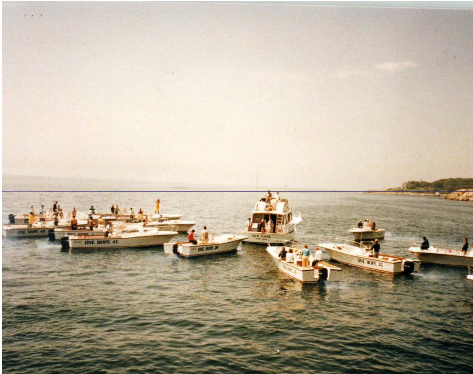
Fleet sanctification ceremony held by each group before the start of Ocean Challenge (Gloucester Harbor, New Hope in the center)