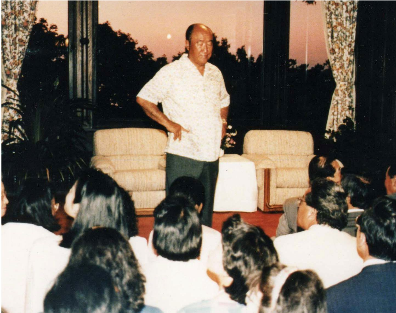
He talks about the purposes and significance of Ocean Challenge program and Ocean Providence (Morning Garden, Gloucester)