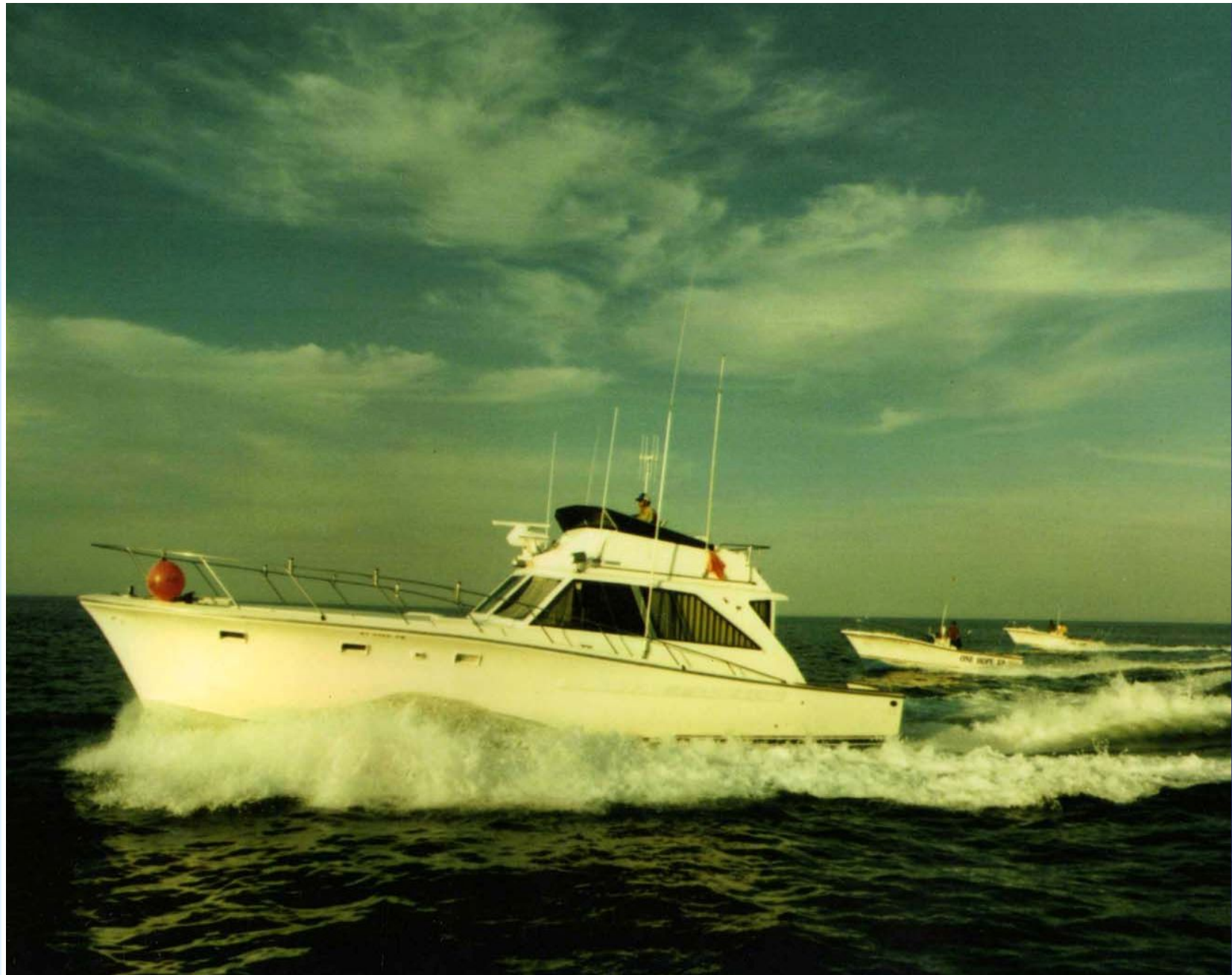
Ocean Challenge fleet advancing towards fishing grounds in a V formation. New Hope leading the fleet; even in fog, this method enables them to arrive at the destination without losing way.