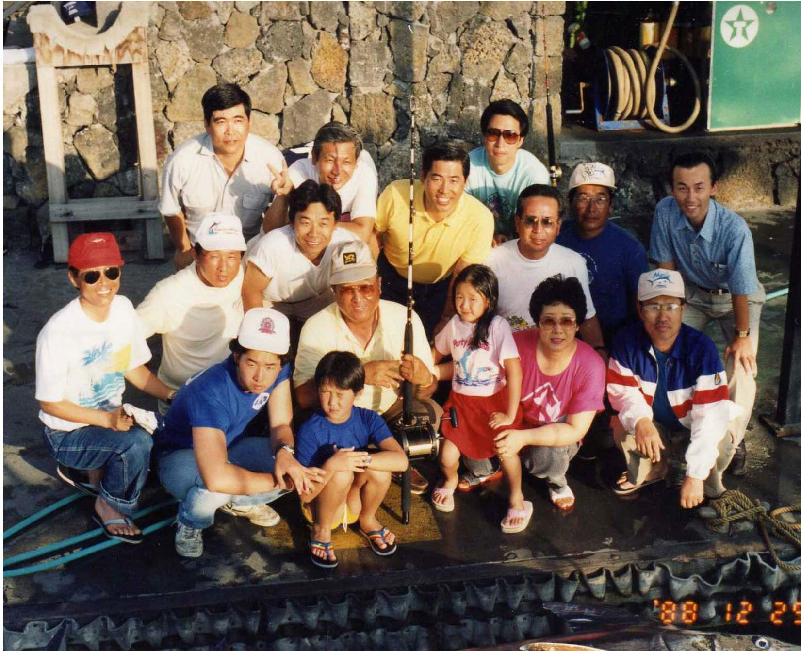
Together with many Blue Marlins they have caught (Kona Marina)