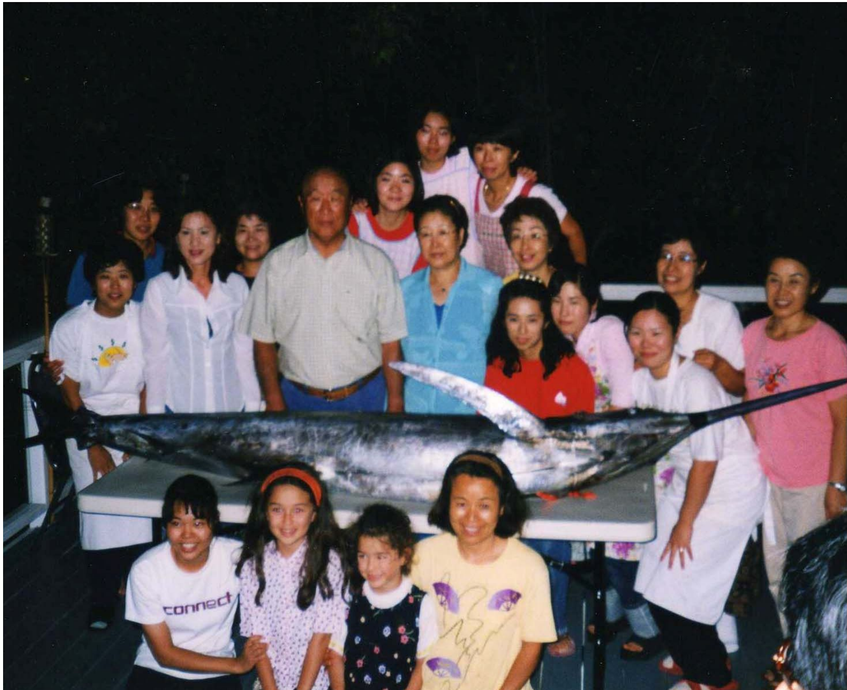
With Blue Marlin (on Kona residence veranda)