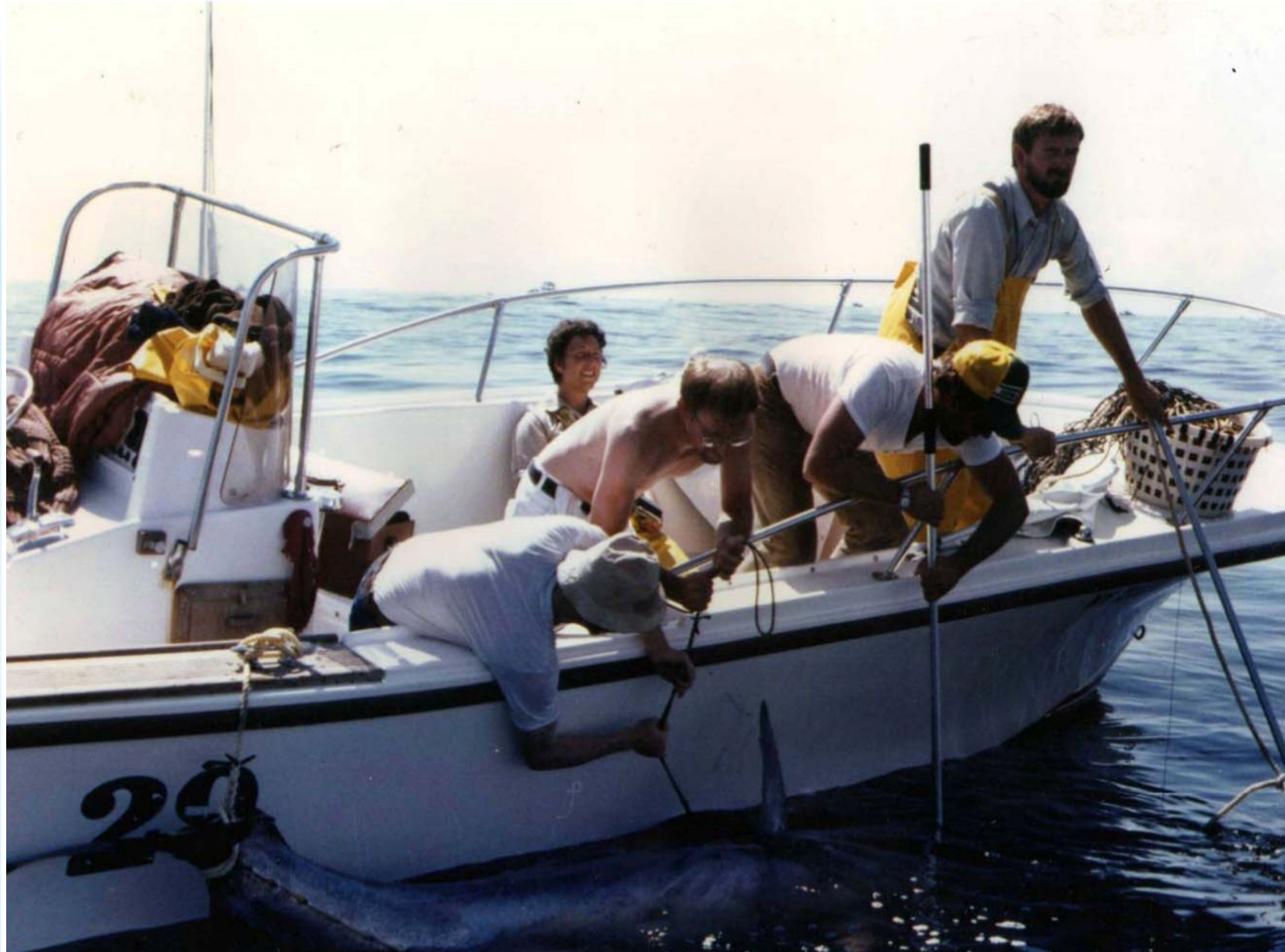
Just tied up the Ocean Challenge Jumbo Tuna to the side of the boat (Boston Harbor, Northwest Corner)