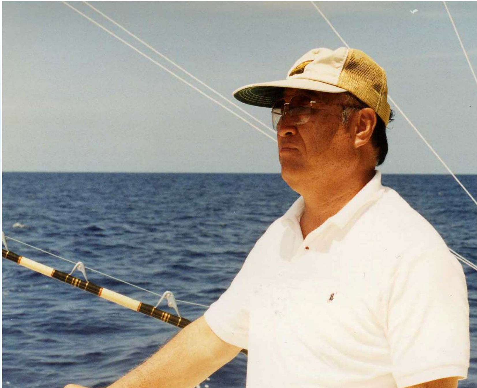
True Father while fishing Blue Marlin (April 11, 1988)