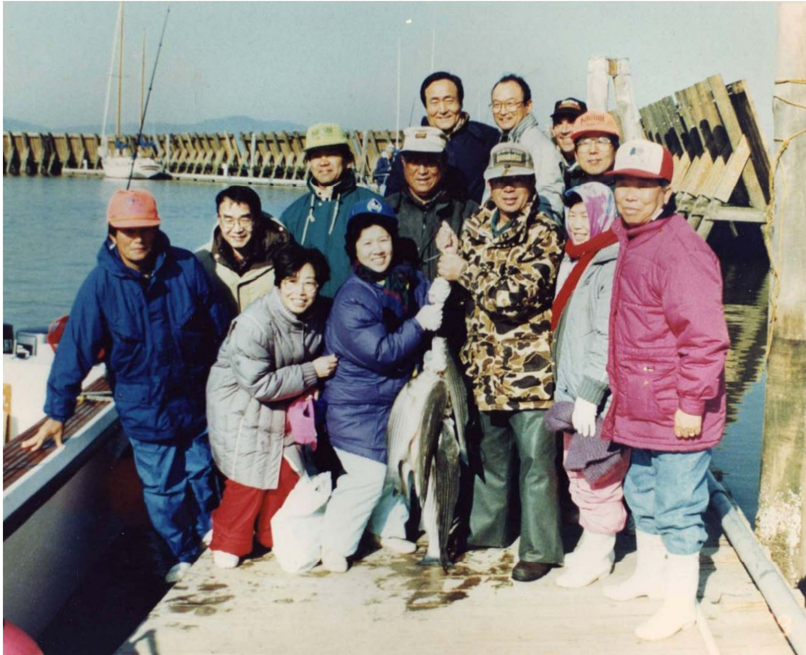
Atop the Half Moon Bay Marina dock, Hudson River