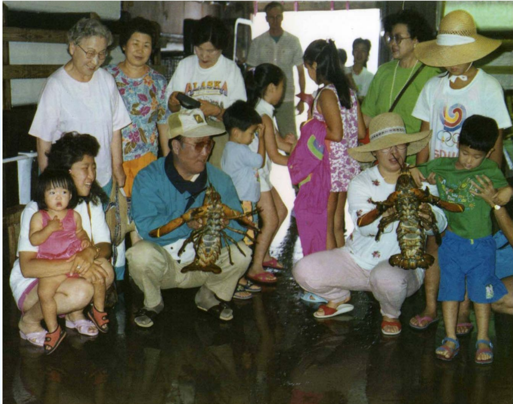
Enjoying a jumbo lobster (International Lobster Inc. Gloucester) (He holds the record as the first to introduce "live lobster" to Japan)