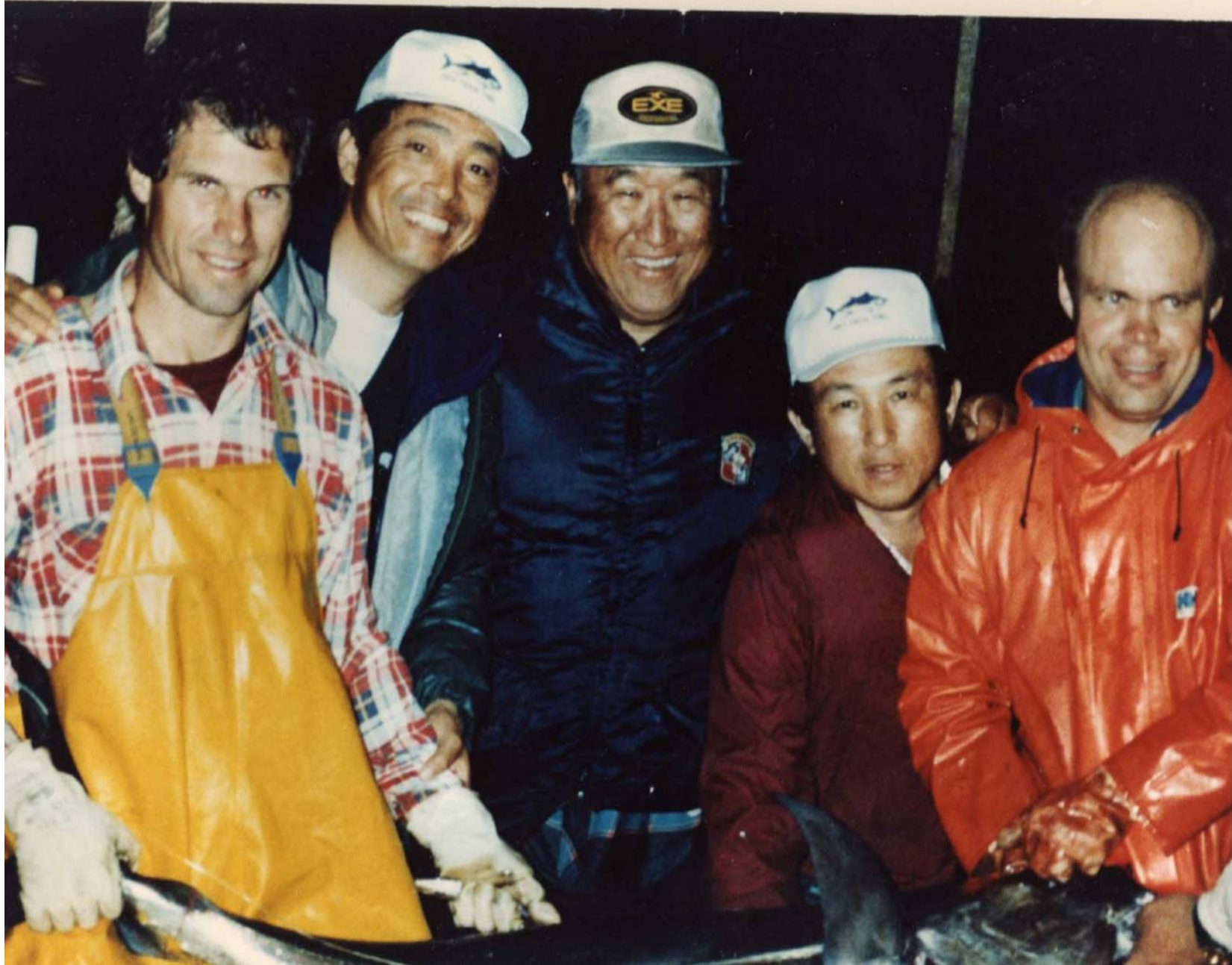
Longline fishing on the Gulf of Mexico (During the 40-day course, he went out to longline fishing on the boat, Sunrise , from Venice, Louisiana. With the captain and crew)