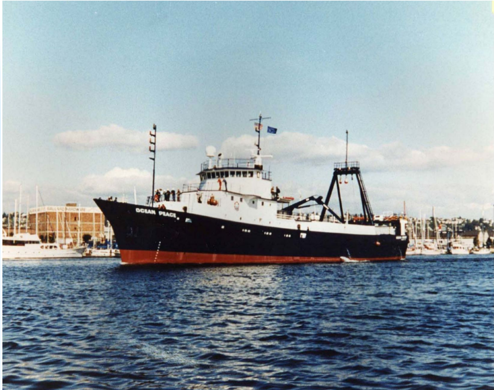
"Ocean Peace" (a trawler/processing ship) heading for the Bering Sea - 1991 (departing from Seattle, Washington)