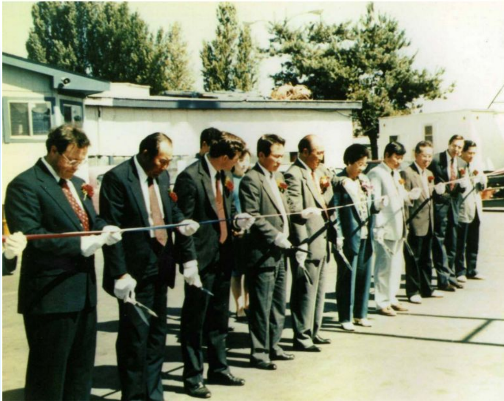
Tape Cut Ceremony for the launching of "Ocean Peace" together with newly appointed Ocean Providence Leaders (Seattle, Washington)