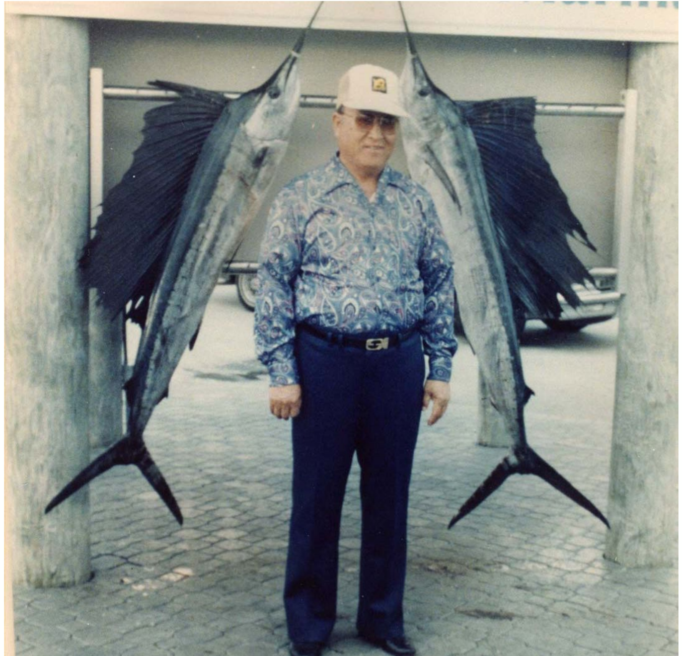
With the sailfish he caught (West Palm Beach) Last Day of the 40-Day Course to Overhaul Ocean Providence in the United States (Dec 13, 1988)