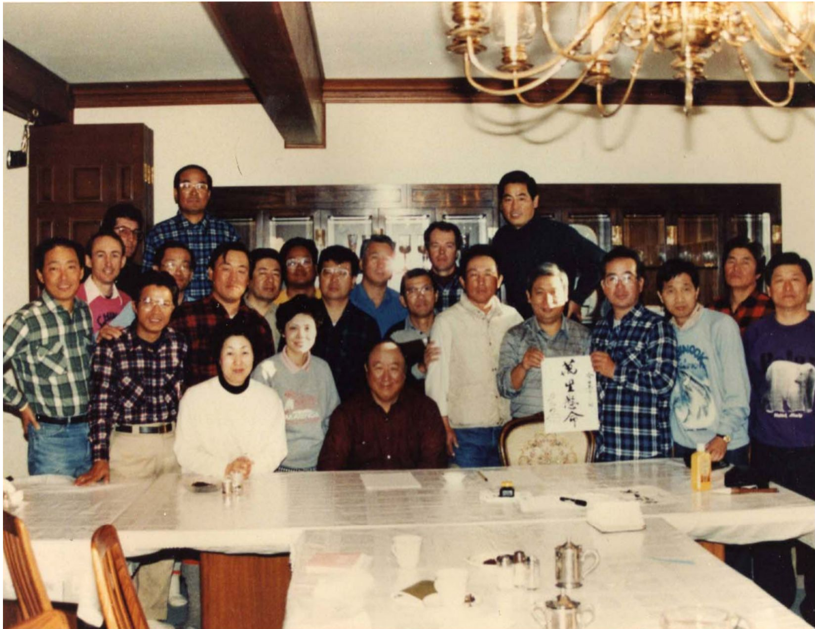
"Million Victories Tireless Work" at Japan-US Joint OC Leaders Workshop (Kodiak, Alaska, Sept. 25, 1989)