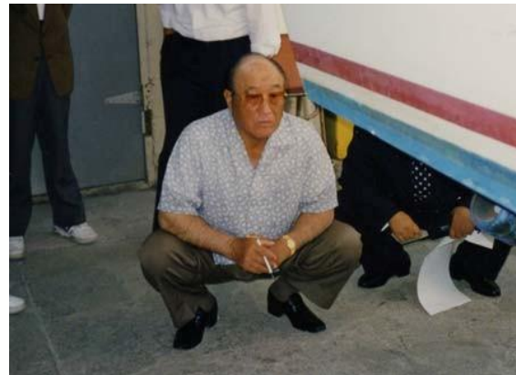
True Father giving detailed instructions at the boat factory May 1994, at Little Ferry Boat Factory

There is a saying that goes something like: "a fish is a favor for a day, but being taught how to fish is a lifetime favor." In order to release humanity from hunger/food problems, True Parents does not simply want to give out one fish, but to provide humanity with fishing method that can rid the problem from its roots once and for all. In order to achieve this, they have been developing a boat that is beautiful, functional, and economical.